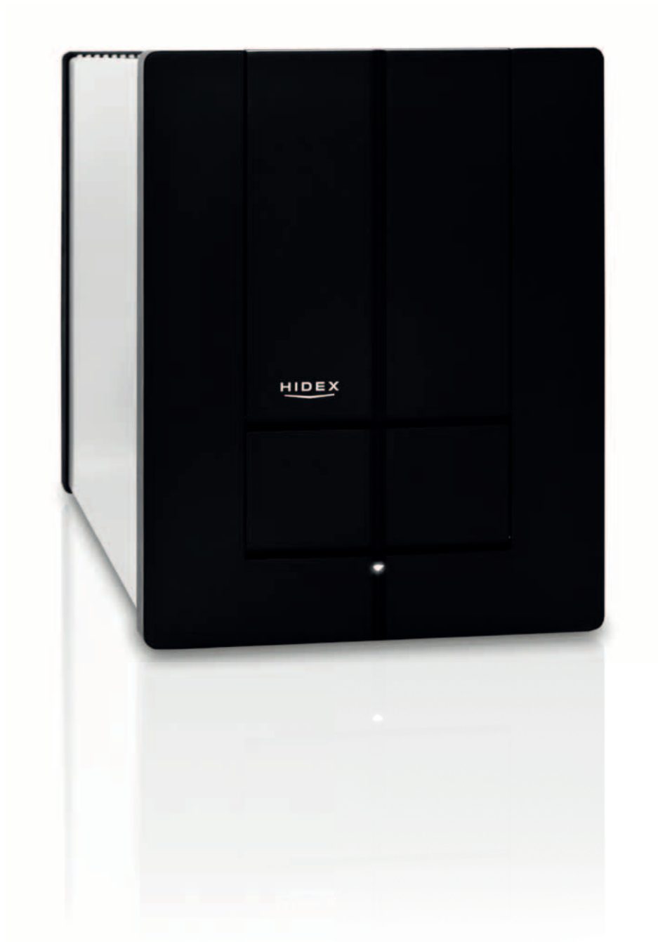
Hidex Sense Microplate Reader